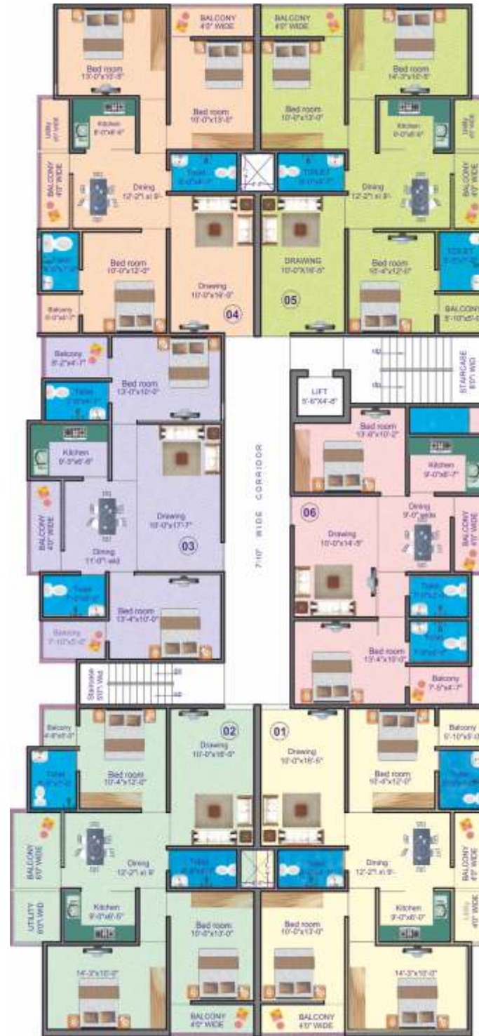
TYPICAL ( 3RD TO 6TH ) FLOOR PLAN